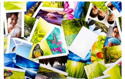
Graphic Art & Photographs

All SmartLF scanners are available in three affordable specification levels; monochrome, color and express color, (m, c, e). m and c models can be easily upgraded via unique Email process if requirements change.