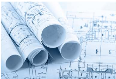
CAD and Technical Drawings

These uniquely versatile scanners capture the sharply defined line detail in technical documents and maps required for AEC, CAD and GIS combined with the highly accurate color reproduction and copying required for graphics and photographic documents – at a price you can afford.