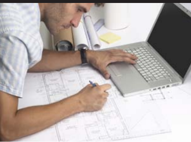
CAD and Technical Drawings